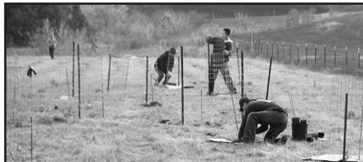
Rodriguez High School students installing tree enclosures at Lynch Canyon