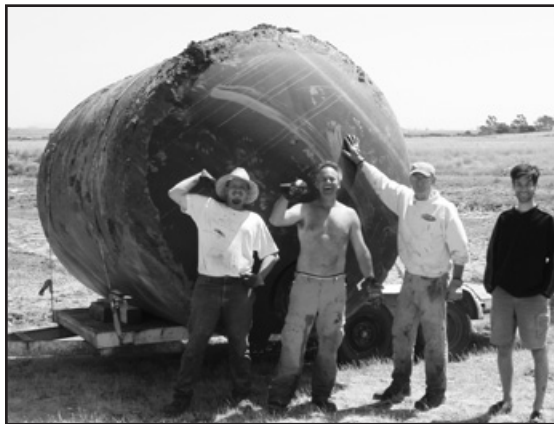
North Coast Slope Soarers help to wrangle a wayward water tank.