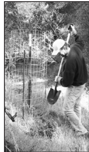
A member of the North Coast Slope Soarers repairs tree enclosures at King Ranch.

Join us this coming season to collect seeds, restore and monitor vegetation, and work on trails. Let us know what your skills and interests are and we will find a satisfying project for you. Check the restoration volunteer schedule on the back of this newsletter. Individuals can just show up. We welcome groups too, but please call ahead so we can prepare. Join us!