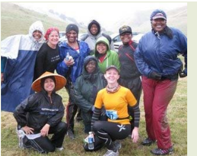
"Crazy Running Ladies" at the finish