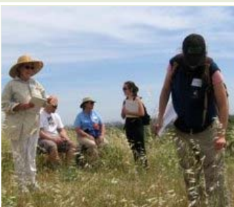
Rush Ranch docents in training