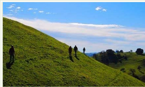
Hikers exploring Rockville Trails